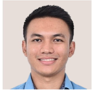
Speaker for Local Public Transportation Route

He is also one of the recipients of the inaugural Laurent Dauby Scholarship Programme of the International Association of Public Transport (UITP) and a member of the University of Auckland's Future Cities Research Hub.