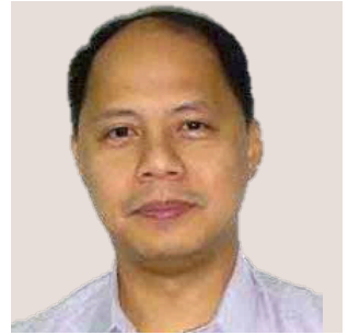
Concept Paper Author and Speaker for Roundtable Discussion Concept Paper

He has published papers on integrated urban modelling and simulation, sustainable public transport, and choice modelling in the local context. He has been leading a research team at UP-NCPAG for the CHED-Philippines-California Advanced Research Initiative (PCARI) Data Analytics for Research and Education (DARE) Project 3: Information Exchange Platform for the Public Sector and an Energy Research Fund (ERF) project on incentivizing eco-driving in the public transportation system in Metro Manila.